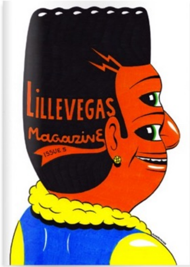
Cover for Lille Vegas Magazine (2011)