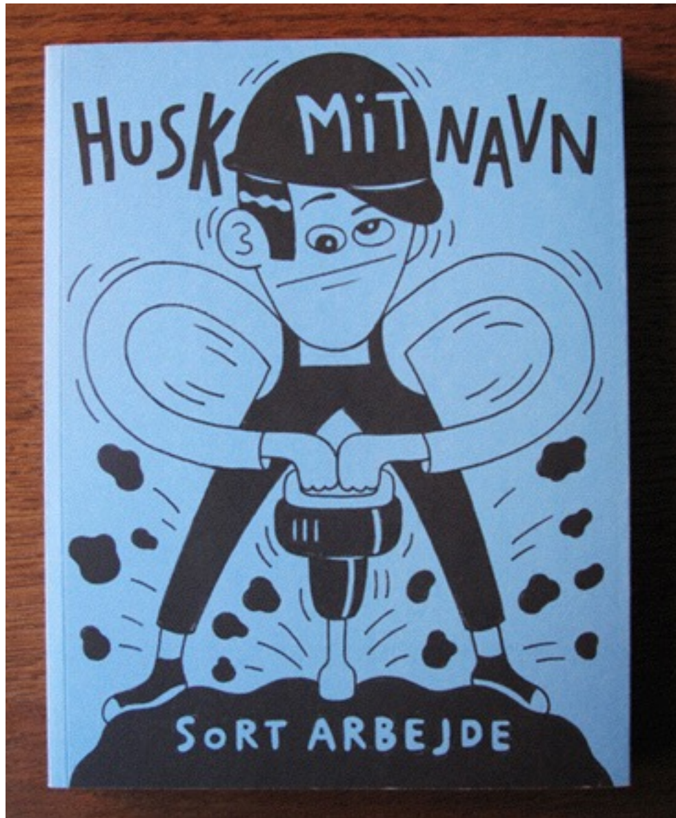
Sort arbejde (Book, 112 pages) (2010) 106 drawings from the summer of 2010