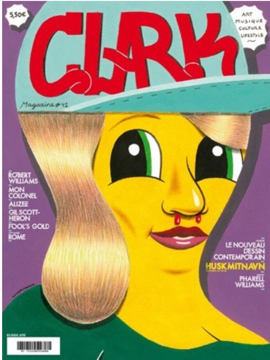
Clark Magazine Cover (2010)