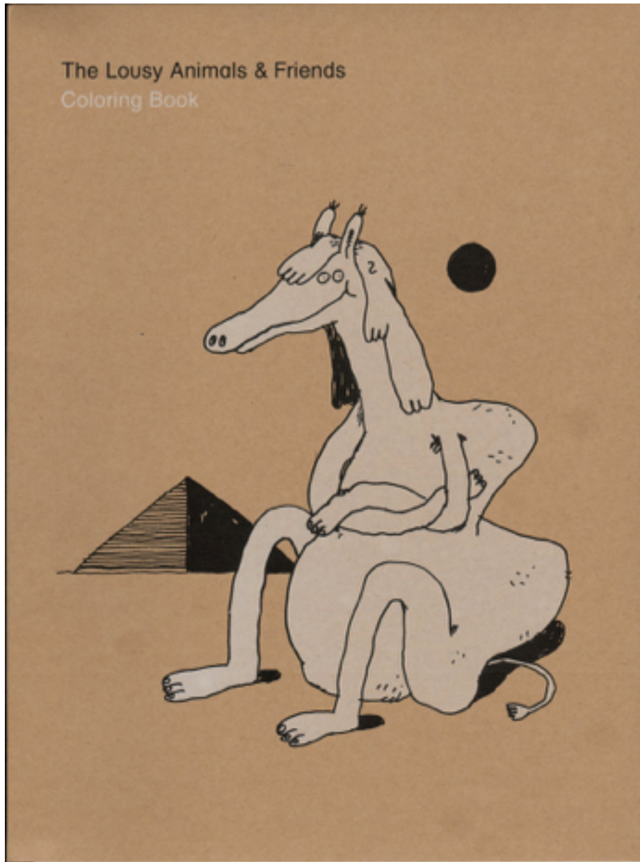
The Lousy Animal and Friends, colouring book Rollo-Press 2008